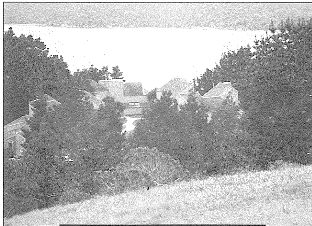
Marconi Conference Center's guestrooms overlook Tomales Bay

We hope that between highly productive meetings you'll have some time to appreciate the rich human and natural history that surrounds us here. Please let us know if there is anything we can do to enhance your stay.